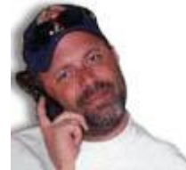
JB Williams Bio

Thrown off balance by the unexpected rude awakening of the normally silent sleeping public, Obama's henchmen immediately set up a direct snitch-line to the White House and ordered its well organized and well funded citizen thug militia into the field of battle at upcoming town hall meetings.